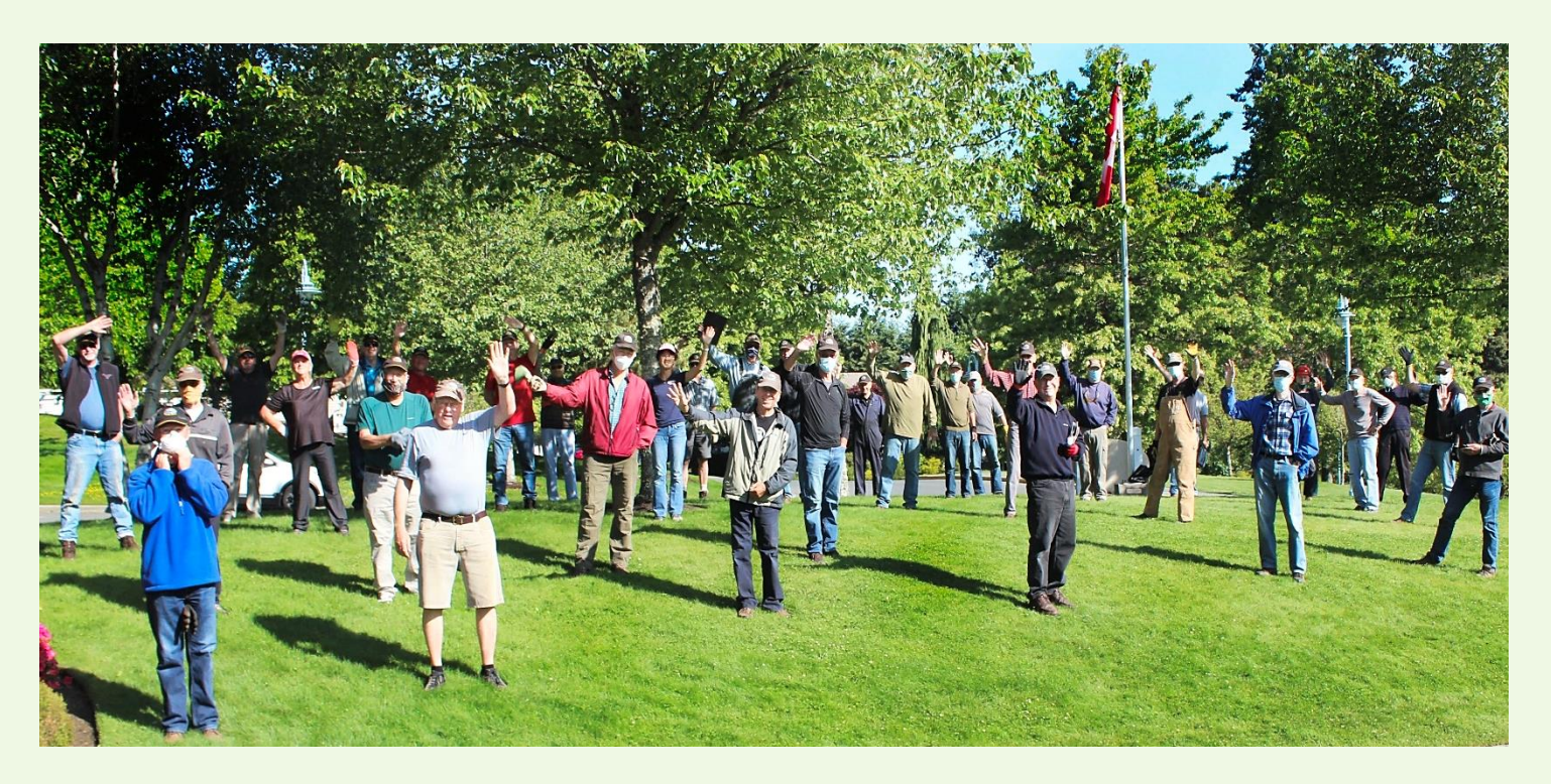
Here's our enthusiastic volunteers kicking off this past spring work session.